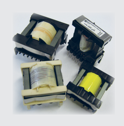
ETD (44,54,59) -series